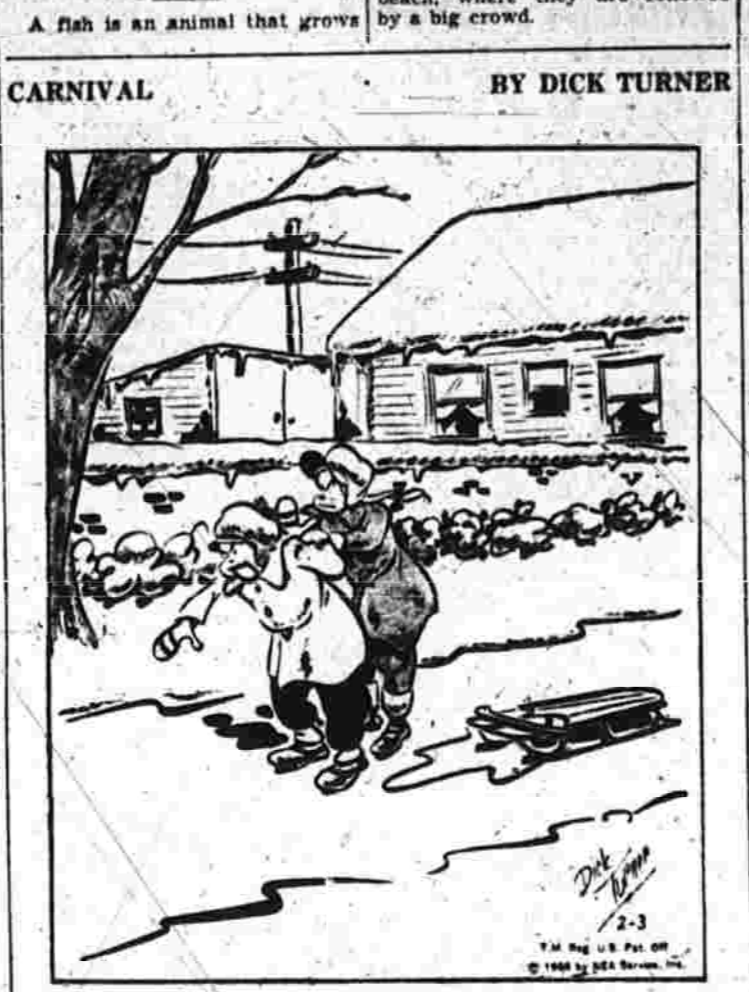
"Okay, Okay, Imogee! So you're NOT a tomboy!"