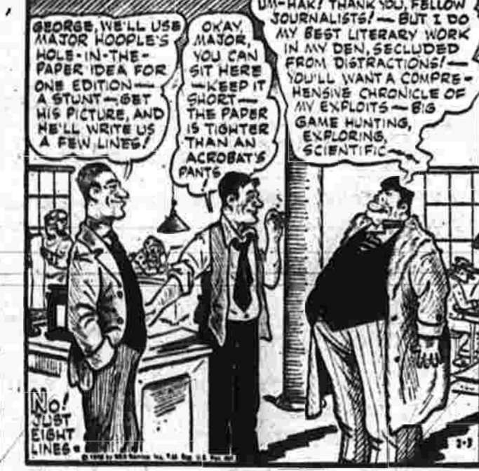
OUR BOARDING HOUSE